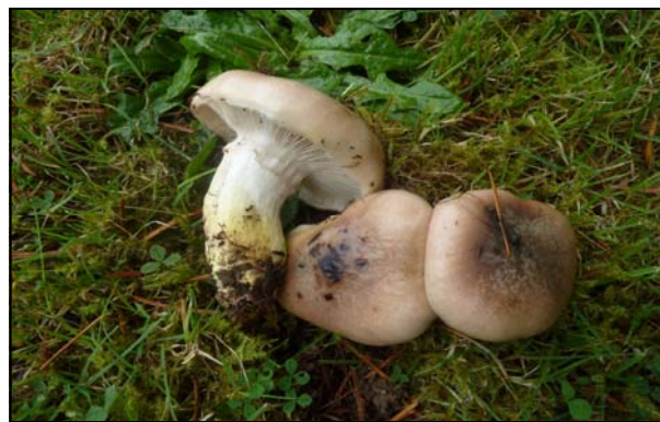
Gomphidius glutinosus hyper-accumulates radioactive Cesium 137

How long would this remediation effort take? I have no clear idea but suggest this may require decades. However, a forested national park could emerge –The Nuclear Forest Recovery Zone–