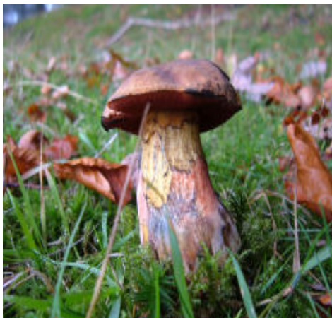
Boletus barrowsii or Barrow's Bolete

It still is not a good year for Pig's Ears but who wants to make silk purses anyhow now that the Calypso orchids are blooming near trilliums and Douglas irises? Hello?