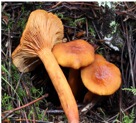
Lactarius rubidus or Candy Cap