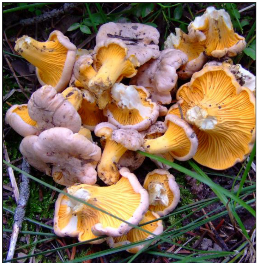
Cantharellus roseocanus