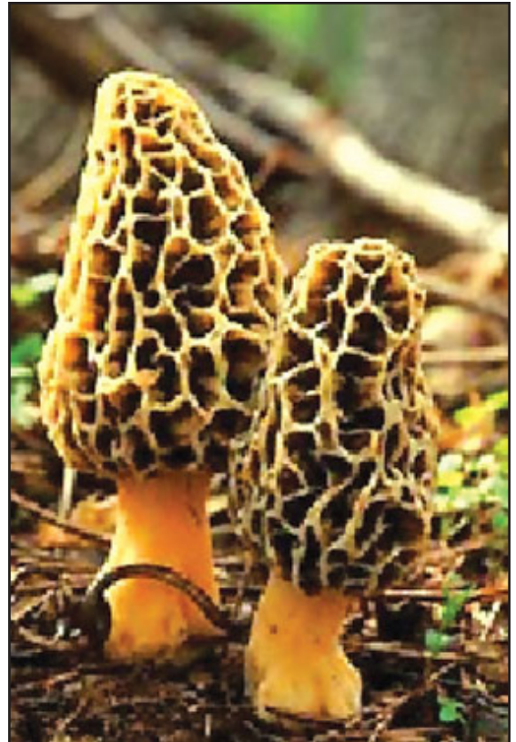
The Mighty Morel