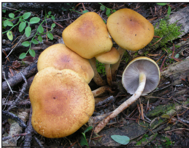
Hypholoma capnoides

But what we received mostly were lists favoring our nationally most well known edibles (in no particular order) old buddies like Boletus edulis and appendiculatus , Craterellus cornucopioides and fallax , Morchella spp., Tricholoma flavovirens , Laetiporus sulphureus , Grifola frondosa , Dentinum repandum and umbili-