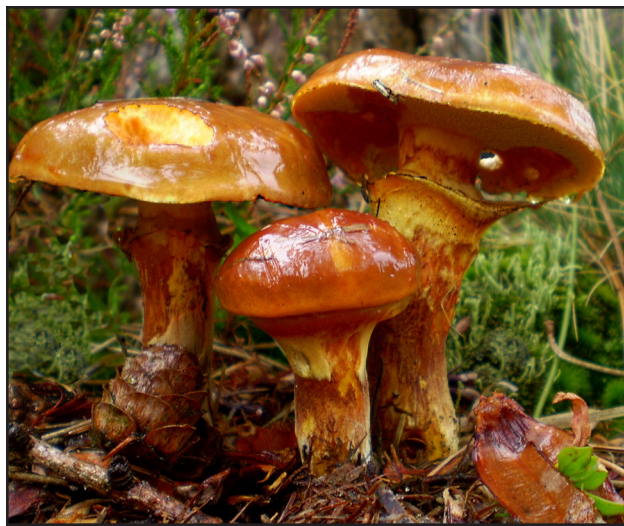
Suillus grevillei

flavor that I'm ranking by--sometimes it's versatility and variety of good cooking styles. For instance, there are many more ways to prepare morels than there