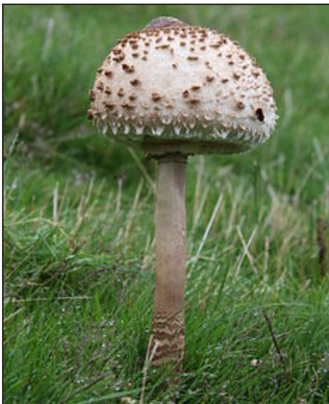
Lepiota procera

In my head I have a mischievous voice that likes to dive in and tell it like it is. Given the chance, I might just say to someone, “You know, we have a term for what you’re expressing; it’s called fungiphobia. I’m sorry to learn that you’re suffering from this affliction, but please don’t spread it around. Also, it’s not wise to reveal that you are so