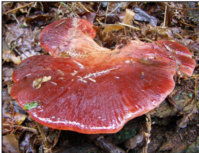
Fistulina hepatica

"The second broad issue is the difference between bought and foraged mushrooms, with particular application to truffles and Italian porcini. Mushrooms