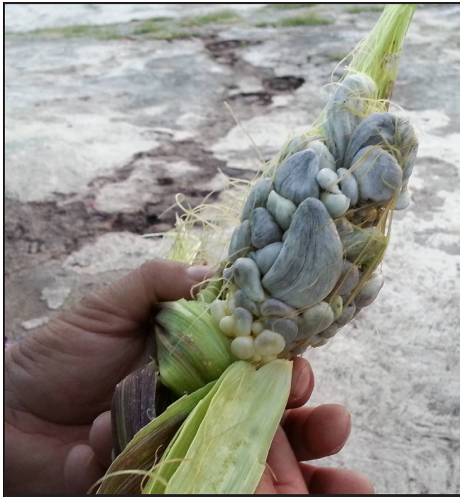
Ustilago maydis-cuitlacoche

Although the cuitlacoche empanadas did not win first prize in the competition, it was the most pleasing