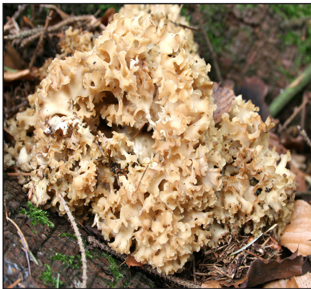
Sparassis crispa