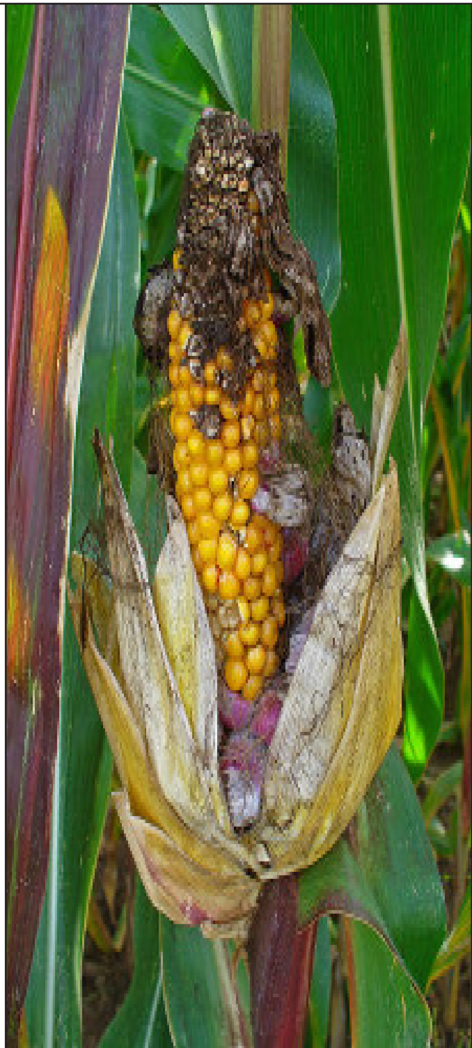
Corn smut