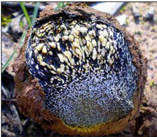
Pisolithus ahirzus

This puffball fungus produces a lovely range of gold to deep rich chocolaty browns or dark red-black depending on the age of the mushroom and the fiber used. Protein fibers such as wool, silk, mohair, etc absorb and hold these pigments best, but a white cotton shirt, human hair, or a car seat (all from my personal experience!) will also absorb the color quite well and permanently! An alum or iron mordant isn't necessary, but I feel that they do improve light fastness of the dye. I always prefer to use rubber gloves to prevent perma-