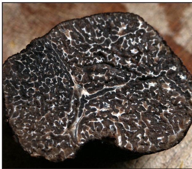
Tuber melanosporum ; Wikipedia

Lactarius fragilis, rubidus (best dried and powdered for desserts), L. indigo , Laetiporus sulphureus (best baked in white wine), Leccinum aurantiacum (best dredged in corn meal), L. insigne (fried with fresh Golden trout), Lepiota rachodes (best sautéed with red meat