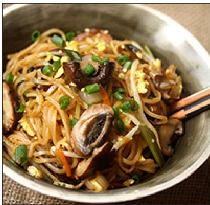
Mushroom Pad Thai; Food & Wine