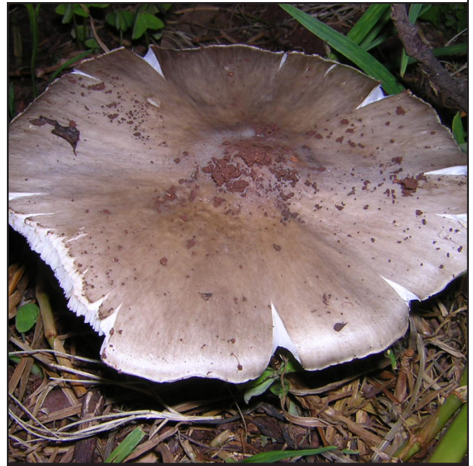
Termitomyces robustus

Each time we've had this mushroom, especially the large, fleshy ones, like Termitomyces robustus , the flavor and tex-