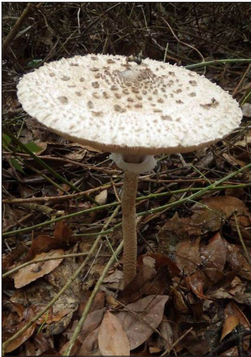
Macrolepiota procera

From the distance he kept and his wary stance, it was clear he was doing neither.