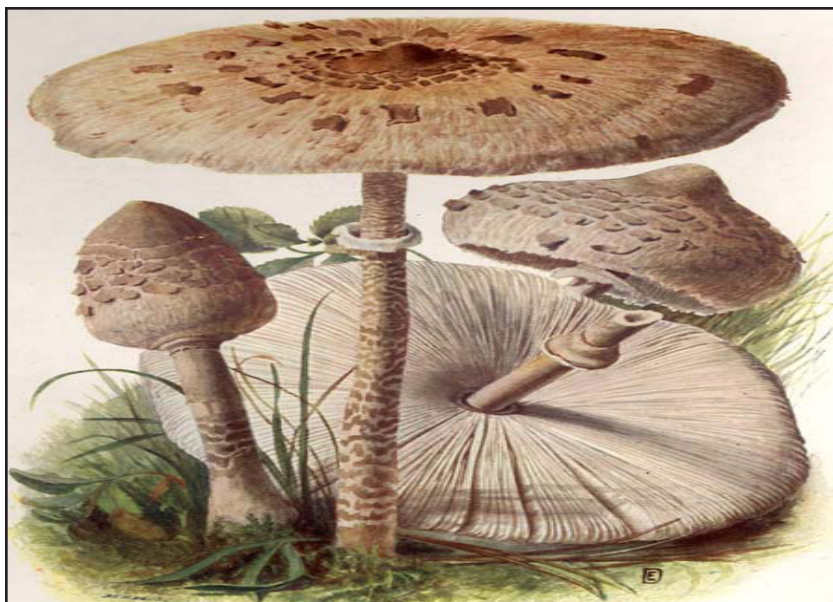
Lepiota; The Mushroom Journal

There must be creative ways to face up to fungiphobia. Maybe we could do a survey at Camp and ask how many have been confronted or accosted by a proselytizer. Was the person male or female? Are women foragers more likely to be victims of this well-intended advice? Maybe we could collect enough interesting stories of fungiphobic encounters to publish an anthology. Face up to it in order to face it down. It's fairly pervasive, fear of fungi, and deserves to be named, described and diagnosed. To handle it with grace and equanimity, maybe we all could use some coaching. There's safety in numbers, though, and I'd love to have that anthology on hand to hold up in front of fungiphobes, like a little bit of magic to ward off the curse they may try to cast on this largely honorable activity.