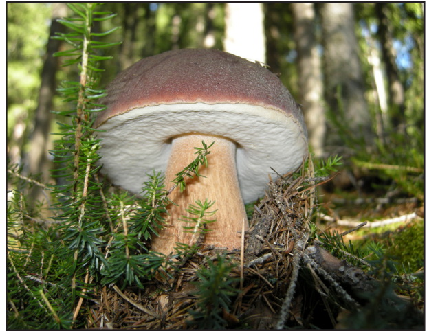
Boletus edulis

Many writers with mushroom lore have described the power of mushrooms and how our lives have been so enlivened by fine fungal finds and