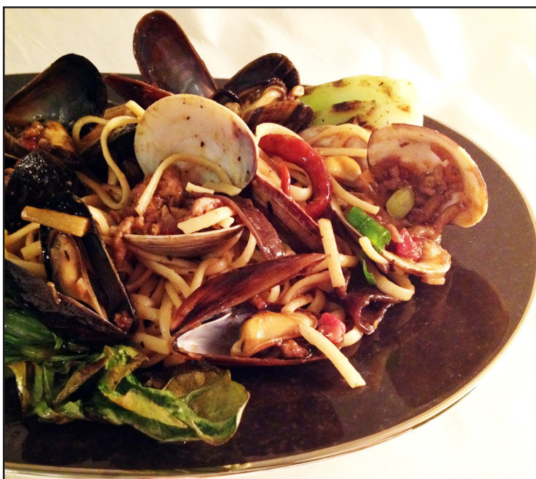
Mussels and Woodears

It is hoped in the future that more SOMA members will be encouraged to join in the festivities and eventually might be convinced to join in the fun in the kitchen. With the hopes of better foraging conditions, future meals will undoubtedly feature more mushrooms.