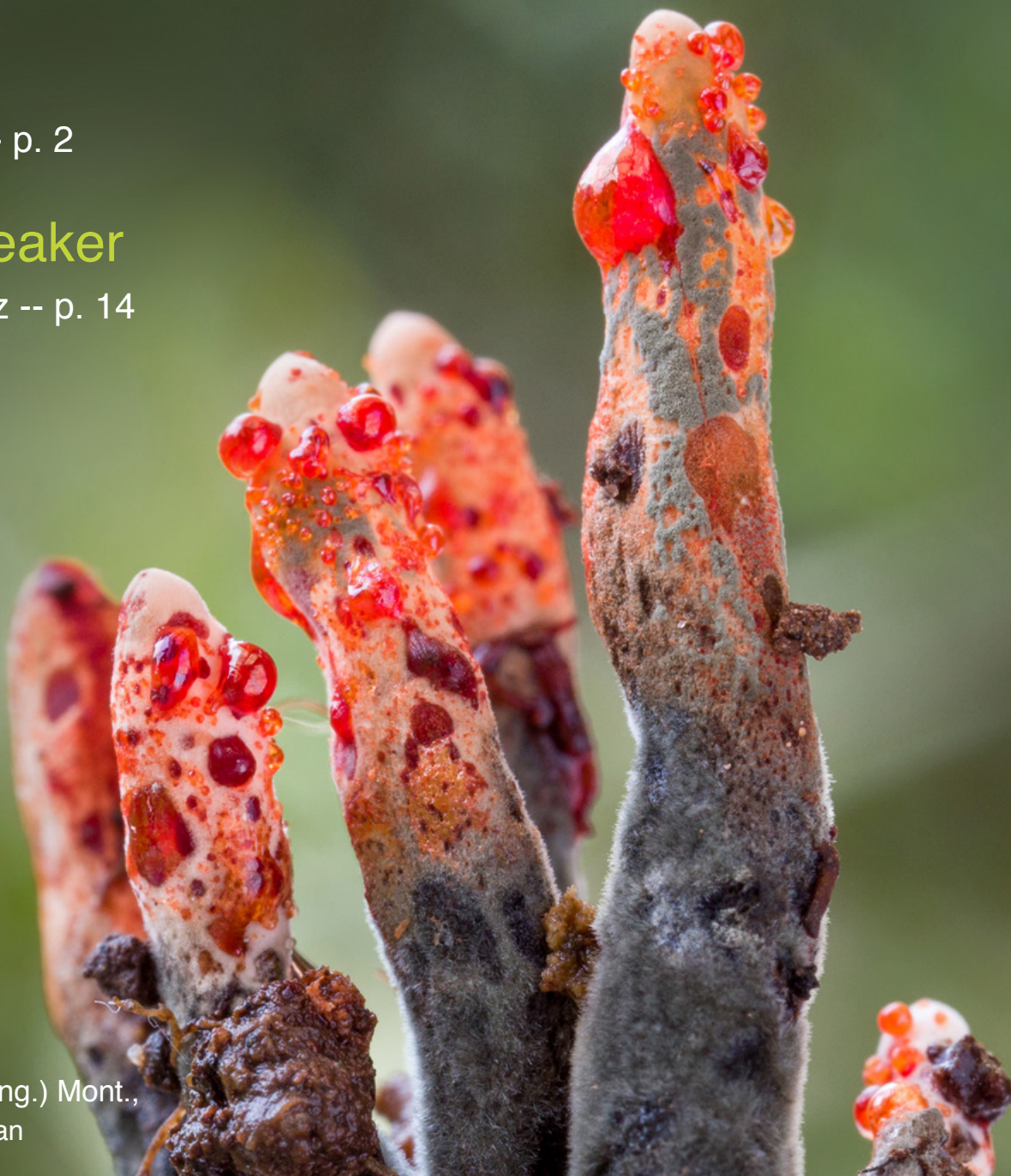
Xylaria globosa (Spreng.) Mont.