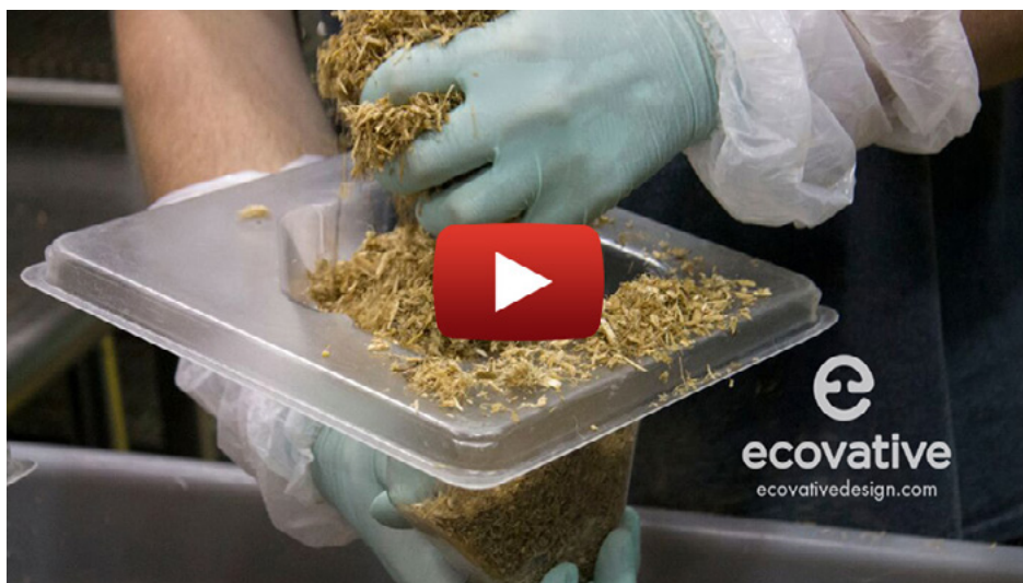
Click to view Mushrooms are the new plastic.