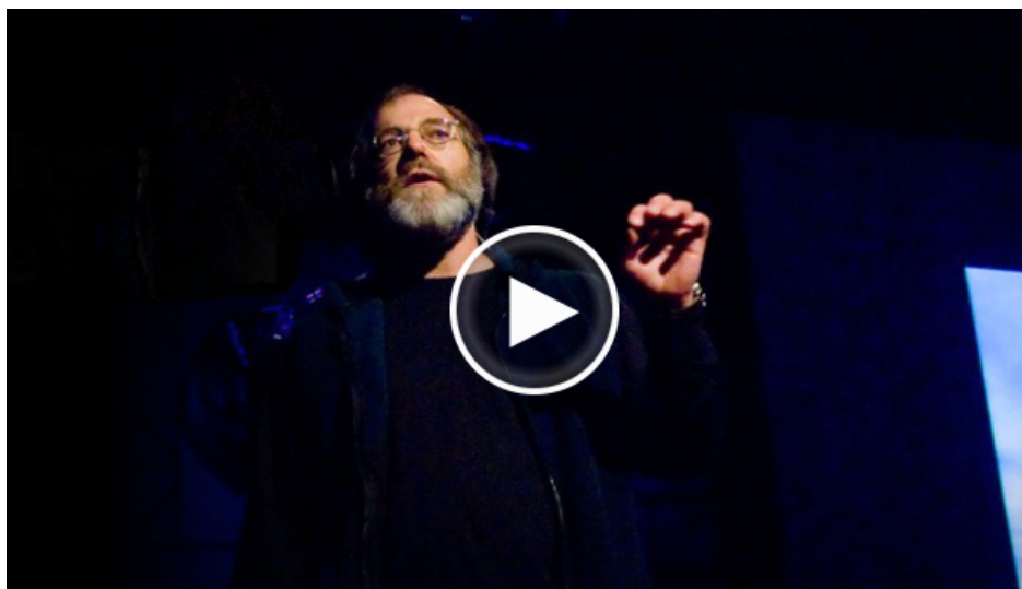
Click to view 6 ways mushrooms can save the world.

Mycelium electrical circuits? No longer so far-fetched. For more information visit ecovativedesign.com or watch TED talks by one of the Ecovative founders Eben Bayer, Are Mushrooms the New Plastic? , and another by Paul Stamets, 6 Ways Mushrooms Can Save the World.